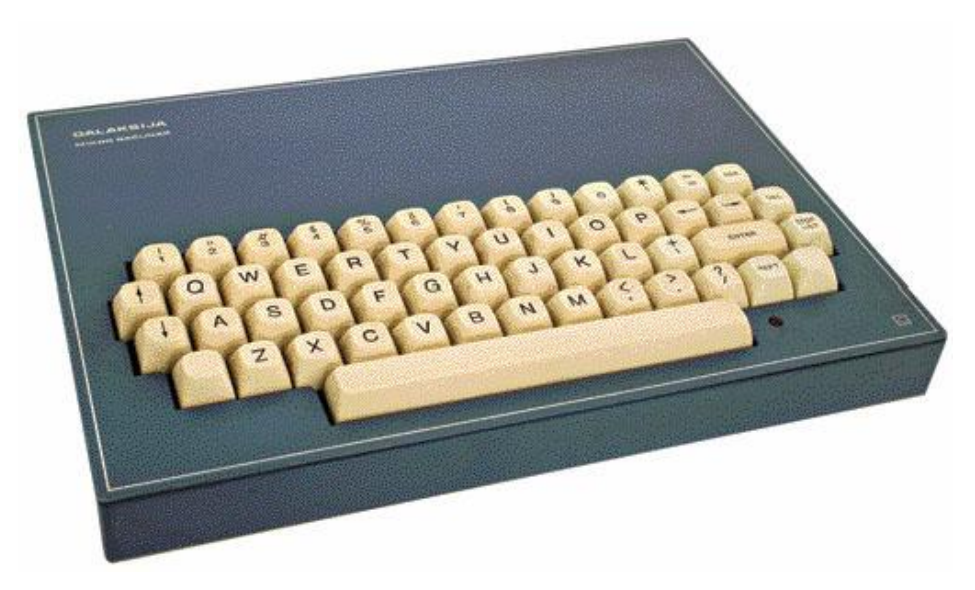
Fig. 4. The Galaksija Computer

Galaksija brought two original solutions. One of them was the software support for video, which simplified the hardware, and made the computer cheaper, which was regarded as particularly important. It also allowed for the single-layer printed circuit board, suitable for the "build it yourself" construction. The second characteristic was a BASIC interpreter that Voja Antonić developed by himself, taking some segments (e.g., the floating point arithmetic) of the TRS 80 Level 1 BASIC. The development and optimization of the interpreter took a lot of work, so the 4 KB ROM also contained the software support for video, the line editor, elementary manipulations with strings, a clock, and links for further expansion of the programming language. BASIC commands had shortcuts [19], for example, P. instead of PRINT, for easy typing and memory savings. The intention to unambiguously reduce all the commands to a single letter requested certain changes in the BASIC syntax, so some of the commands were renamed - for example, TAKE instead of READ or BYTE instead of POKE.