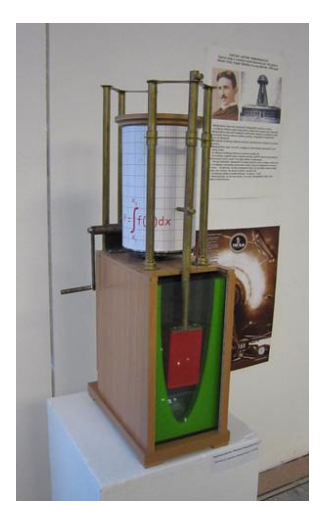
Fig. 1. Mihajlo Petrović's hydro integrator