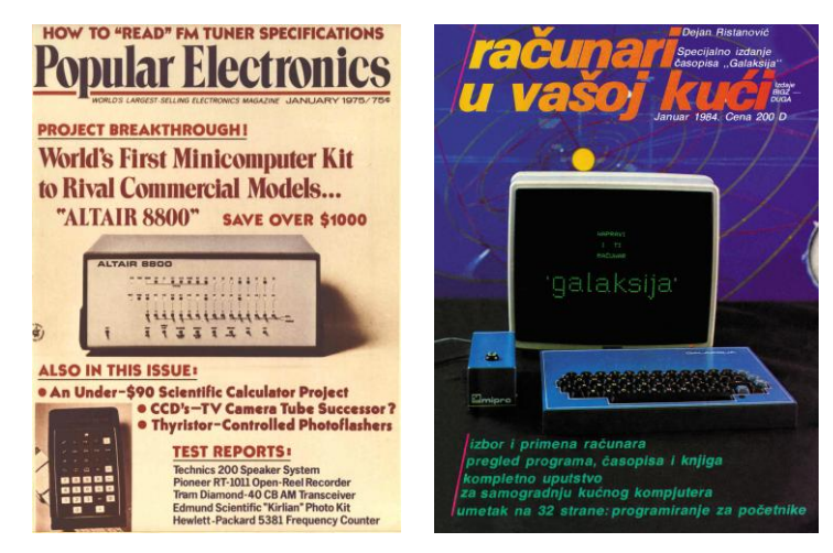
Fig. 5. Magazines that promoted "build it yourself" campaigns

for Galaksija could legally be imported from abroad by post, and the production of the printed circuit boards, the keyboards, and the case has been organized in Yugoslavia.