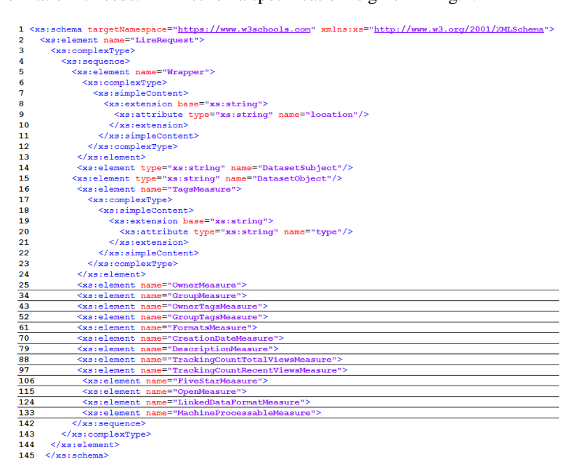
Fig. 2. XML schema for REM's request to WRAPPER

Information provision between REM and WRAPPER occurs by exchanging XML documents. REM issues request to the WRAPPER by sending the XML specification of the information it needs. XML schema specification is given in Fig.2.