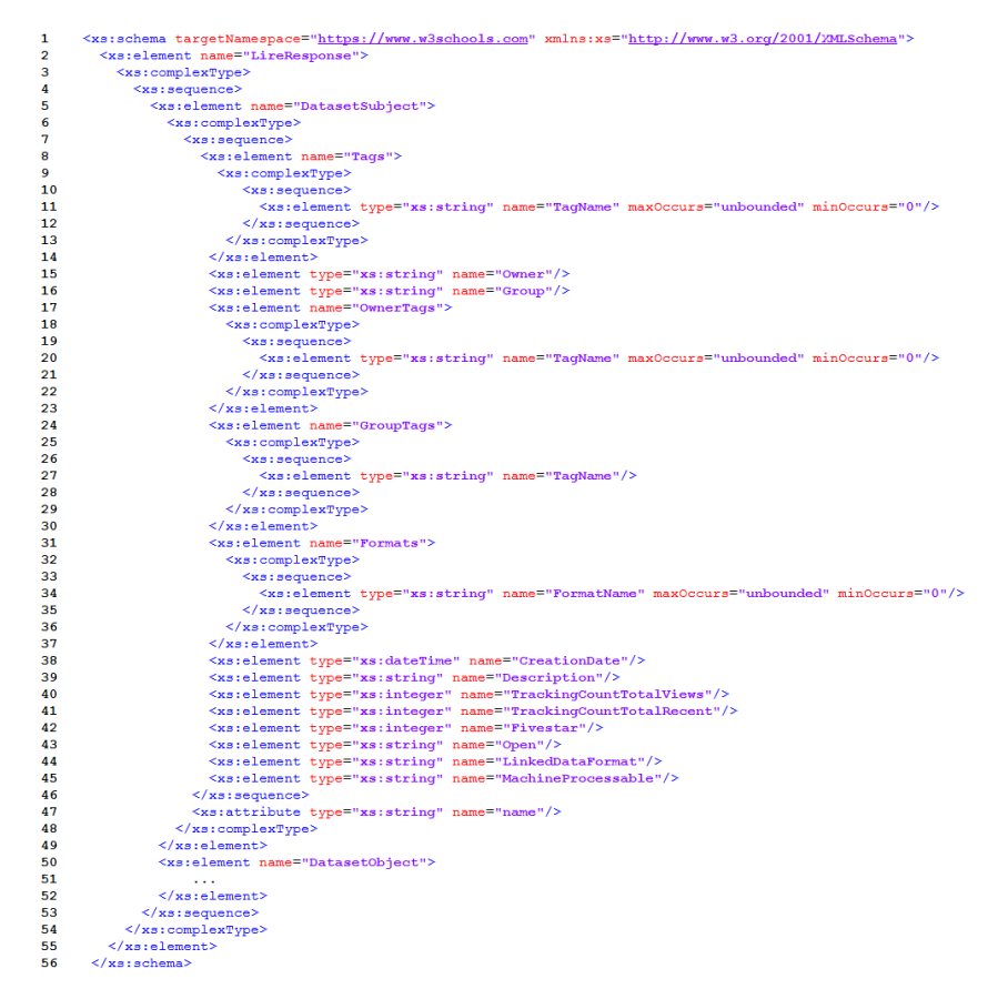
Fig. 3. XML schema for WRAPPER's response to REM