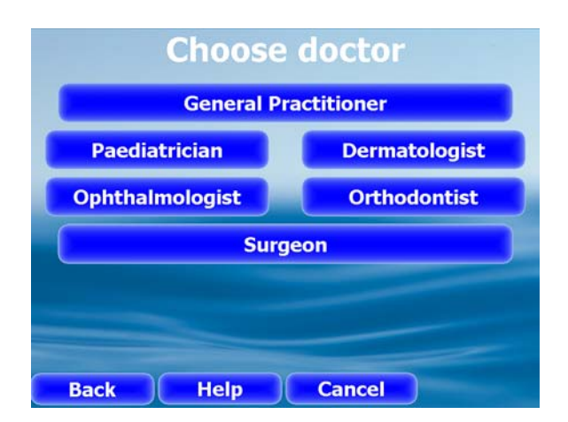
Fig. 3. Second screen of the kiosk application.

Third screen asks user if he/she has a recipe. If the answer is "Yes", then user should be instructed what to do next (to keep this example simple, we just go to the first screen). If the answer is "No", the user is instructed to first visit a doctor.