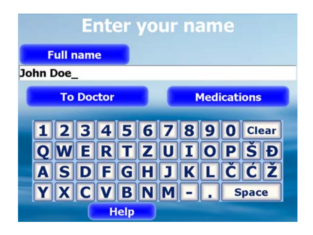
Fig. 2. First screen of the kiosk application.