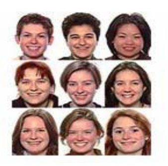
Fig. 2. An example of Passface which shows nine faces in a grid

User should choose the correct one from these nine faces and this step will repeat four times. "Passface" is based on assumption that people can recognize human faces easier than other pictures. Nevertheless, Valentine [25][26] has shown that "Passface" protocol is very memorable over long interruption. This is easier to remember, but not secure, users click four times in a nine grid has only equal third of the login failure rate of alphanumeric-based password [21].