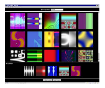
Fig. 1. Random images select used by Dhamija and Perrig [18]

Recognition-based technique is a kind of graphical password authentication techniques which need to choose those correct pictures from many pictures. Dhamija and Perrig [18] propose a scheme which can use Hash Visualization technique [1] to support recognition-based graphical password authentication. Kotadia [16] proposes a new recognition-based graphical password authentication that is a multi-image technique with one step for authentication. In Dhamija and Perrig's system, the system shows some random generated images and the users are asked to select a certain number of images for the authentication in the graphical interface [18], as shown in Fig. 1. Before use, the user needs to set in advance through the authentication sever to identify images. However, the average log-in time is longer than input alphanumeric password, but the result showed that 90% of all participants succeeded and the text-based password with PINS only 70% in the result [27]. The scheme proposed by Dhamija and Perrig was not really secure because the passwords need to store in database and that is easy to see.