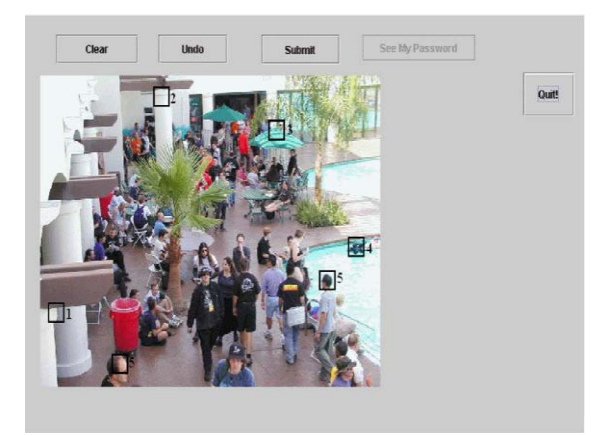
Fig.5. An example of Passpoints graphical password input interface

discussed the graphical interface. The graphical interface includes a rich picture and several buttons, as shown in Fig. 5. The size of the picture is 451 x 331 pixels and the grid square around a click point is set to 20 x 20 pixels. The special buttons of graphical interface is the "See My Password" button, and it allows users to view their password when they are clicking for ensuring the correct password. Users choose sequence of these memorable points to be the password and it can be hashed that means more security of this graphical password system.